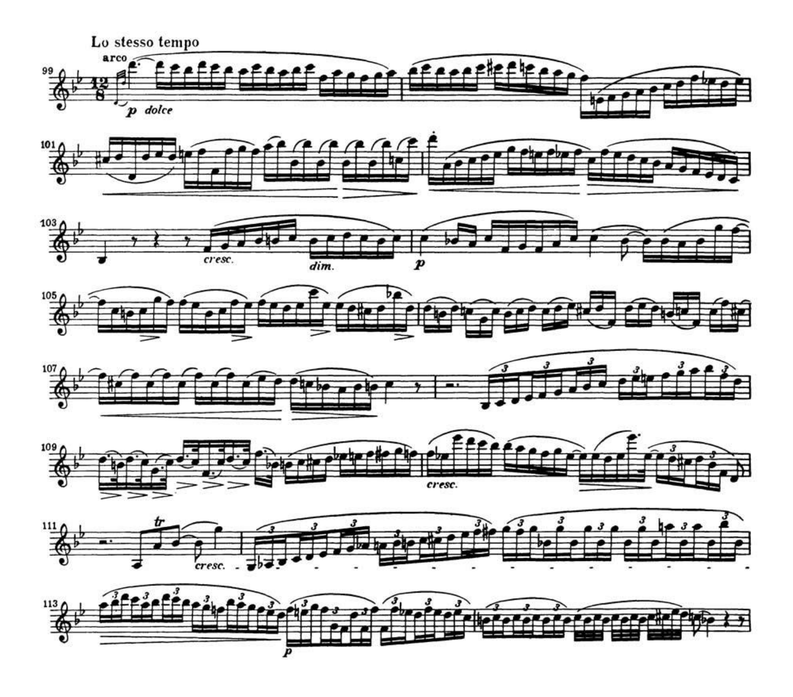
Excerpt 1 Beethoven, Symphony No. 9, mvt III, mm. 99 -114